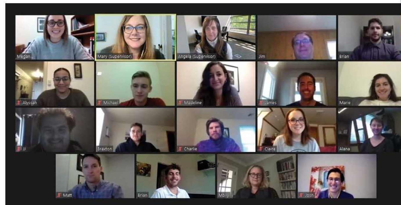
Remote MVLC, Fall 2020