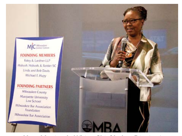
Hon. Maxine A. White, Chief Judge, District 1